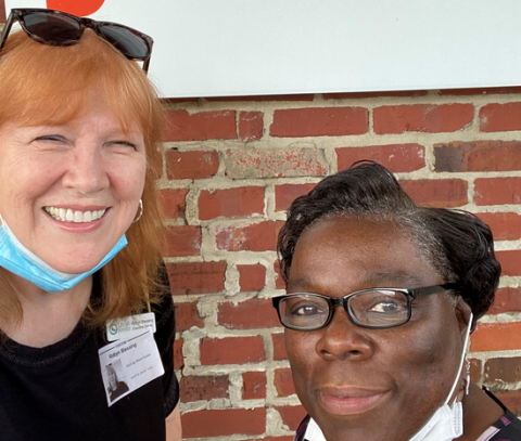
Birmingham Family Fun Day at the YWCA