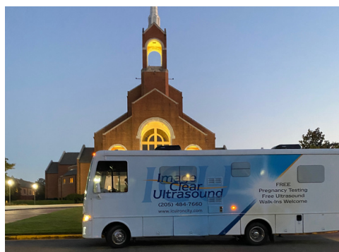
Briarwood Presbyterian, 2/10/2022 Blessing of Mobile Unit #3