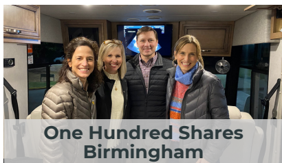
One Hundred Shares Birmingham